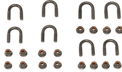
RFMTTC2 Roof Mount Tubular Clamp Kit