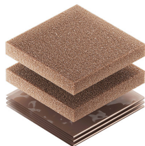
1500CI Corrosion Intercept Kit