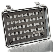
1500MP EZ-Click™ MOLLE Panel