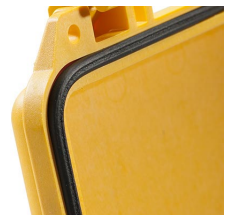
1753 Replacement O-ring