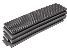
1755AirFS 4 pc. Replacement Foam Set